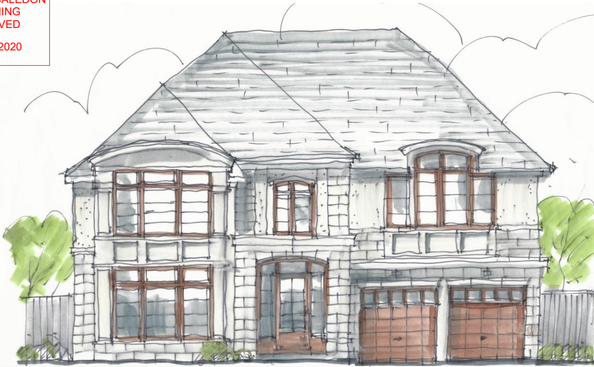
47' SINGLE A