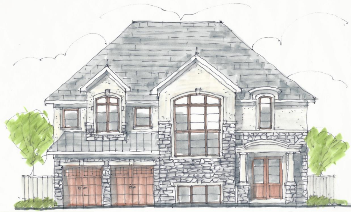
47' SINGLE B