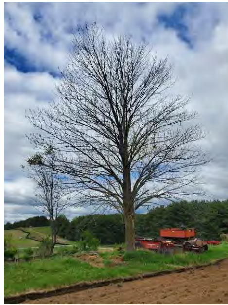
Figure 16: Tree 59