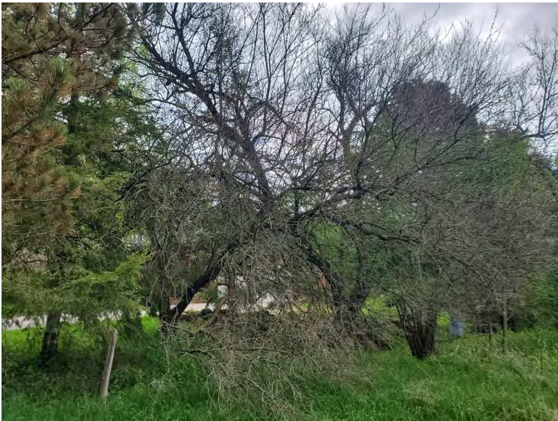
Figure 9: Trees 21-24