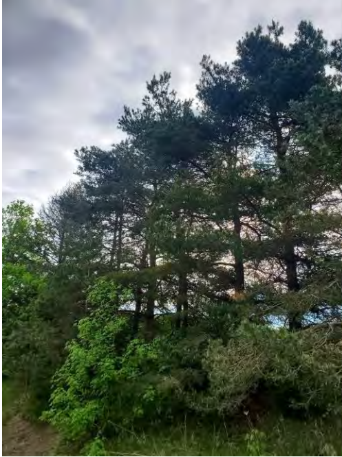
Figure 3: Trees of group 1.

A selection of images have been included to describe the conditions of the property and general context of trees on the site.