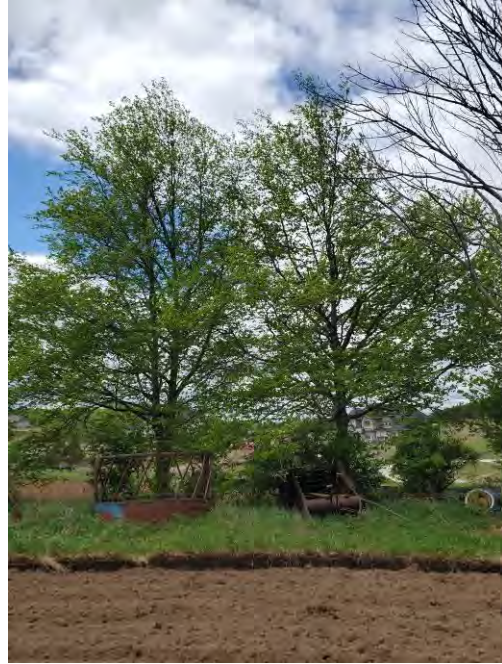
Figure 14: Trees 55 to 56