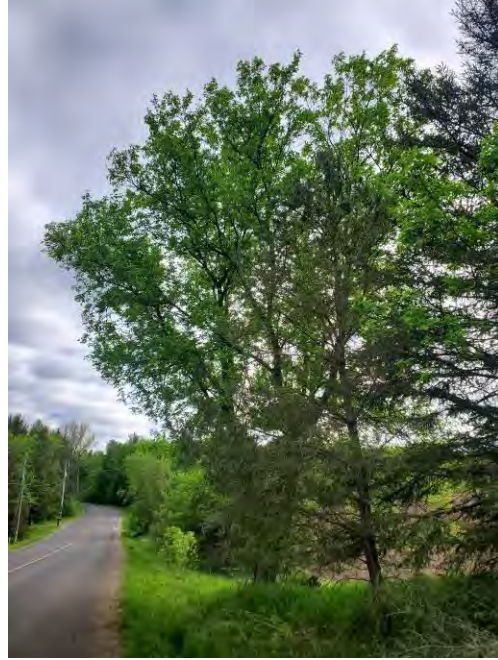
Figure 4: Trees 2 and 3.