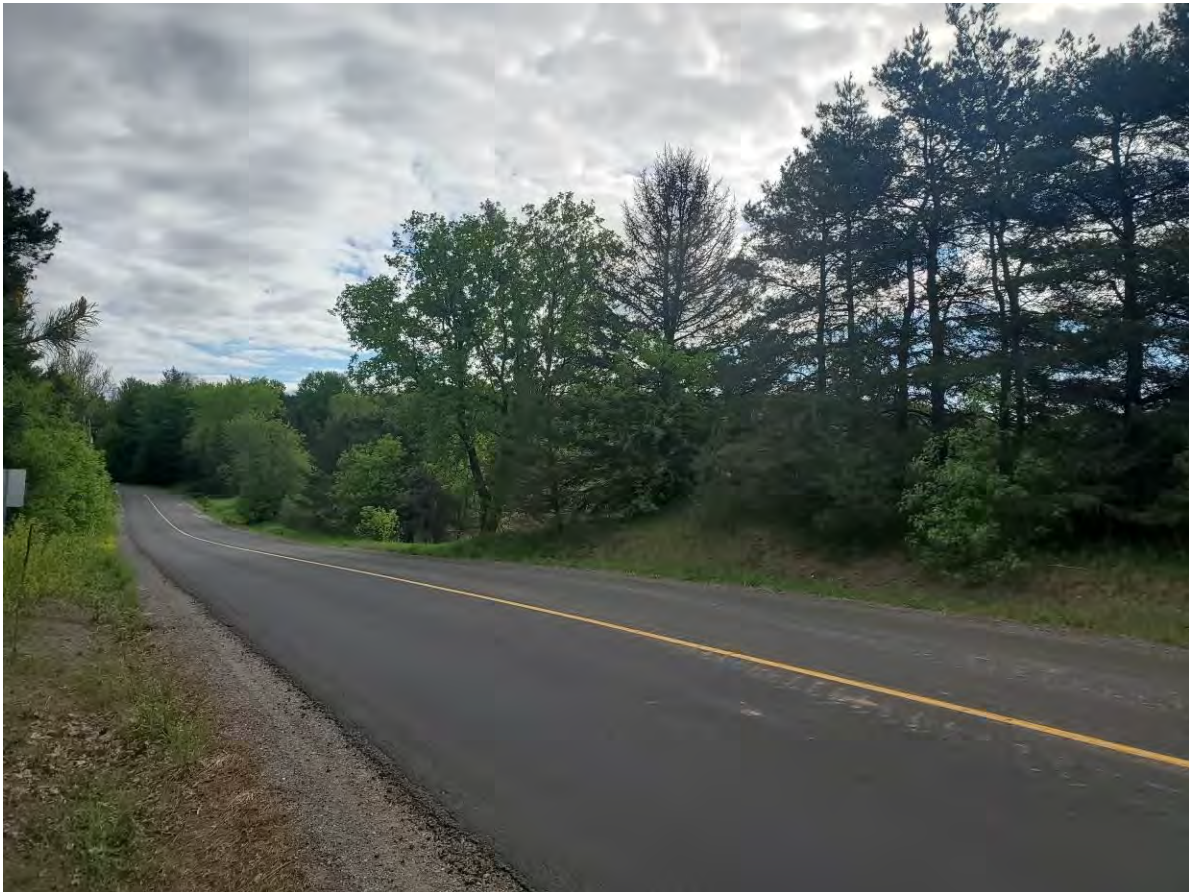
Figure 2: View of right of way looking east from other side of road on west end.

The portion of the property subject to this development application is the area currently occupied by agricultural uses. The proposal calls for large estate residential lots. Care has been taken to set all lots back from the naturalization areas to minimize conflicts between naturalized areas and developed residential areas.