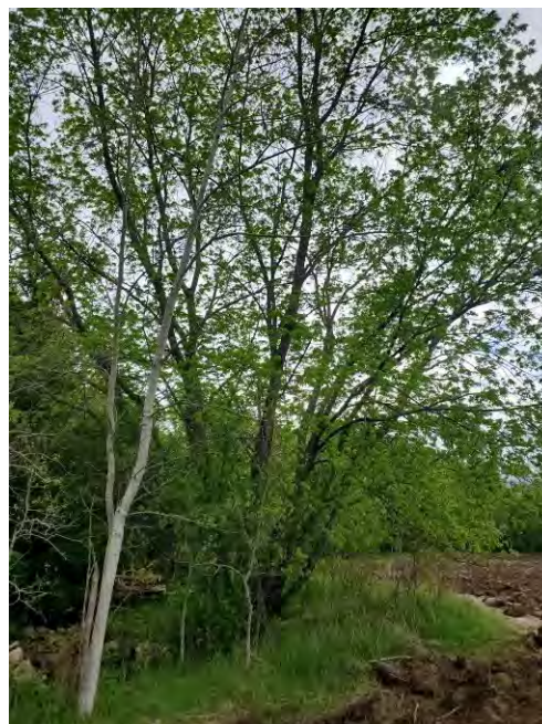
Figure 12: Trees 42 - 49.