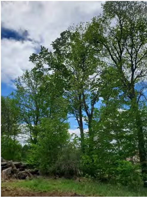
Figure 15: Tree 74