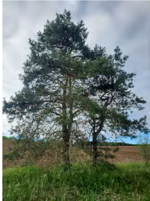
Figure 6: Trees 12 and 13.