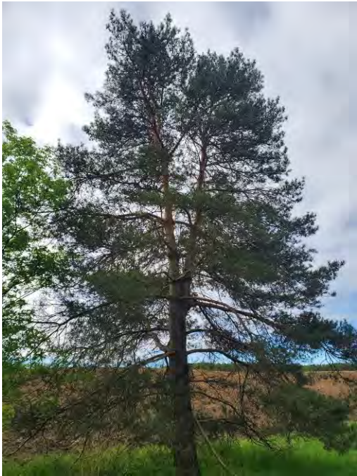
Figure 7: Tree 14