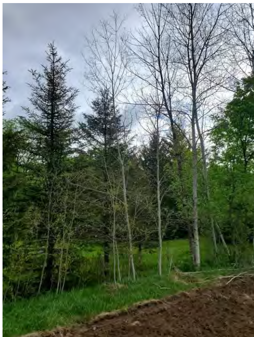
Figure 11: Trees around tree 37