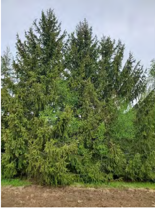
Figure 13: Trees 65 to 73