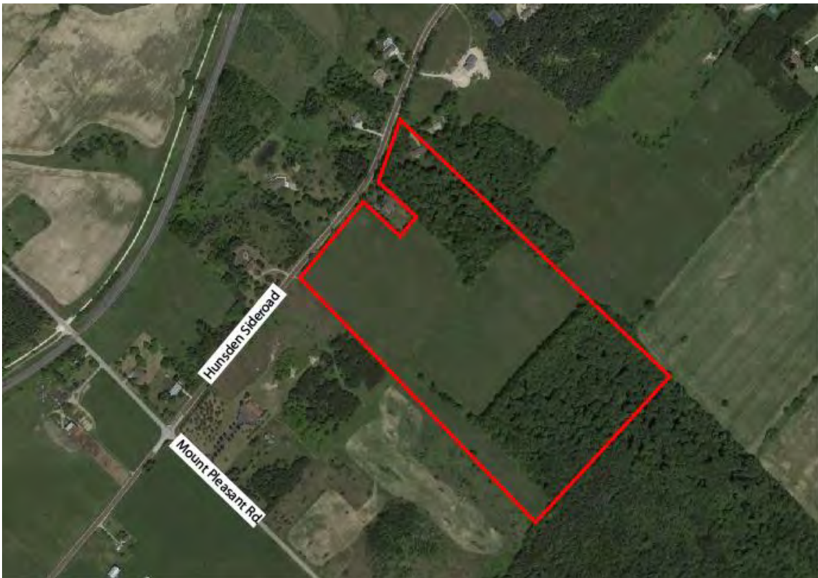
Figure 1. Context Aerial Image

The site was visited in May 2022 and visited again in August of 2023. It is located at 10249 Hunsden sideroad on the south side and just east of Mount Pleasant Road in Caledon, Ontario. The property is in a rural area with residential uses to the north and east of the property and also naturalized landscapes to the east, south and west of the property. The property has a substantial portion that is under cultivation, however some naturalized woodlots are present on the site that also extend beyond the property boundaries.