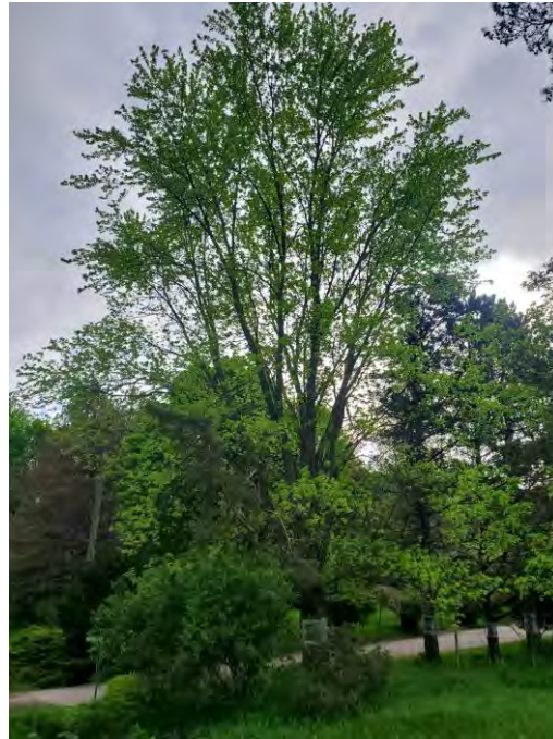
Figure 8: Trees 16 in foreground