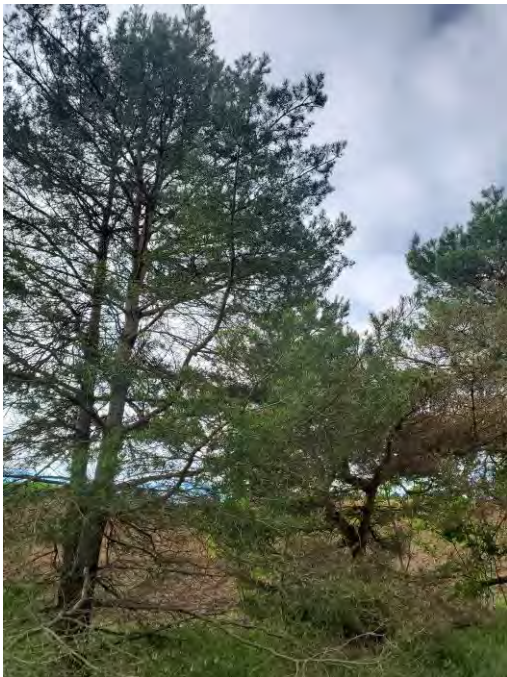
Figure 5: Tree 8.