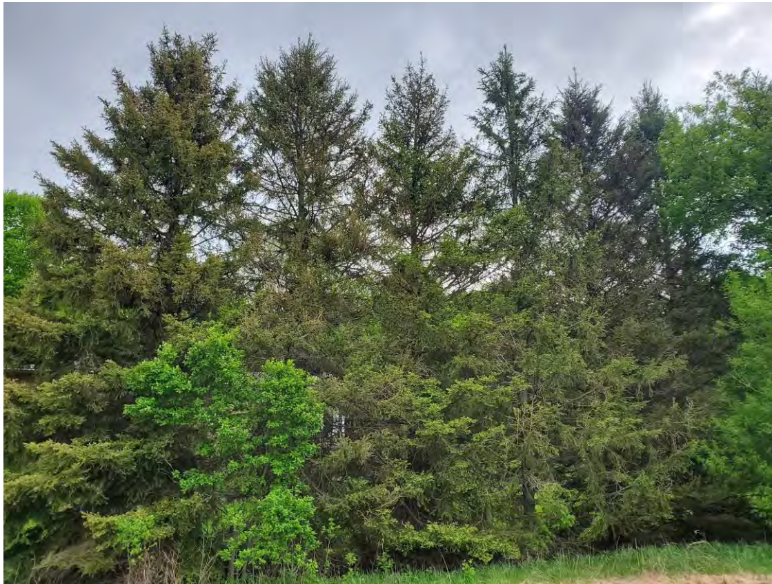
Figure 10: Tree 30