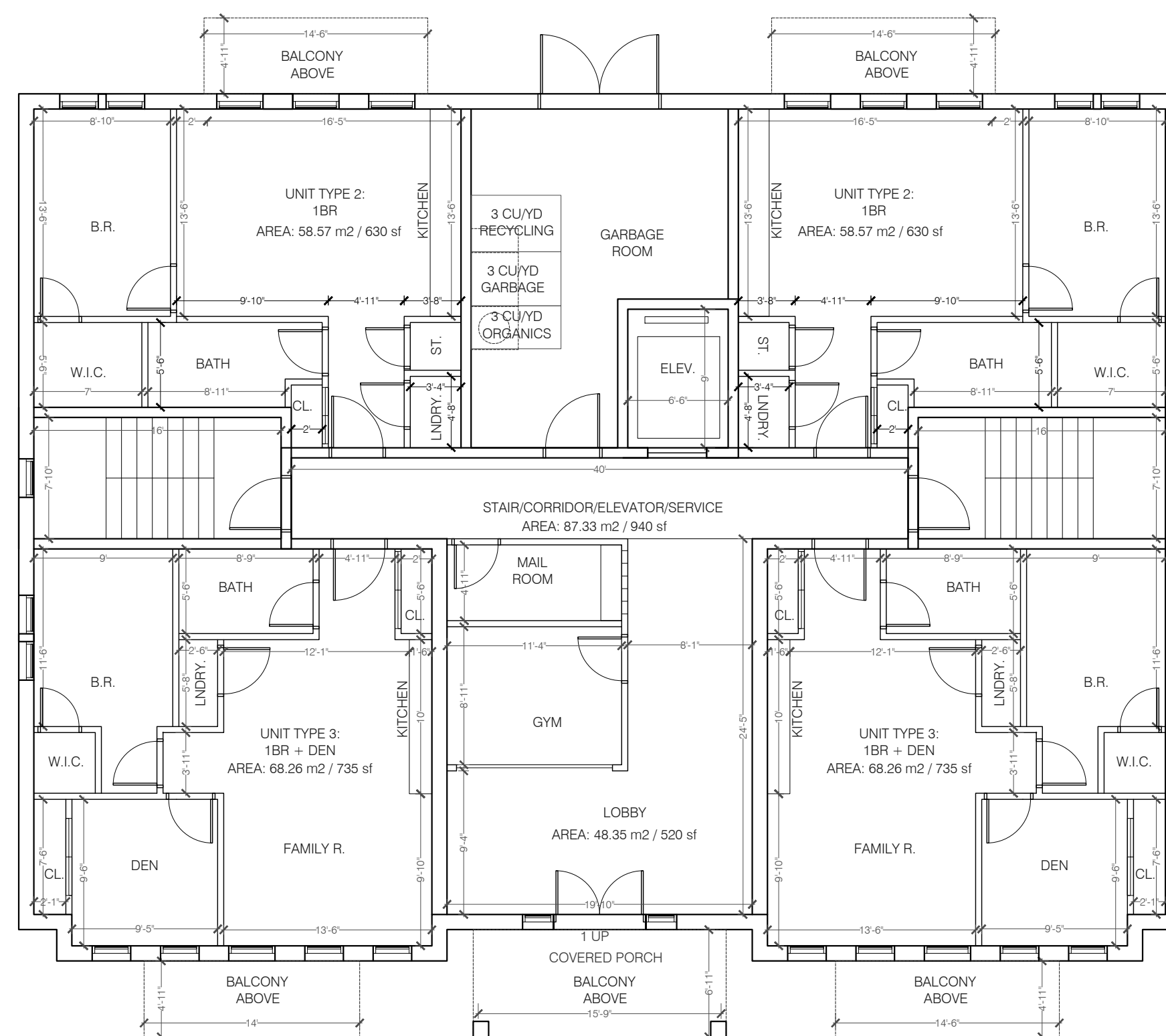
1 MAIN FLOOR PLAN A201 SCALE: 1:100