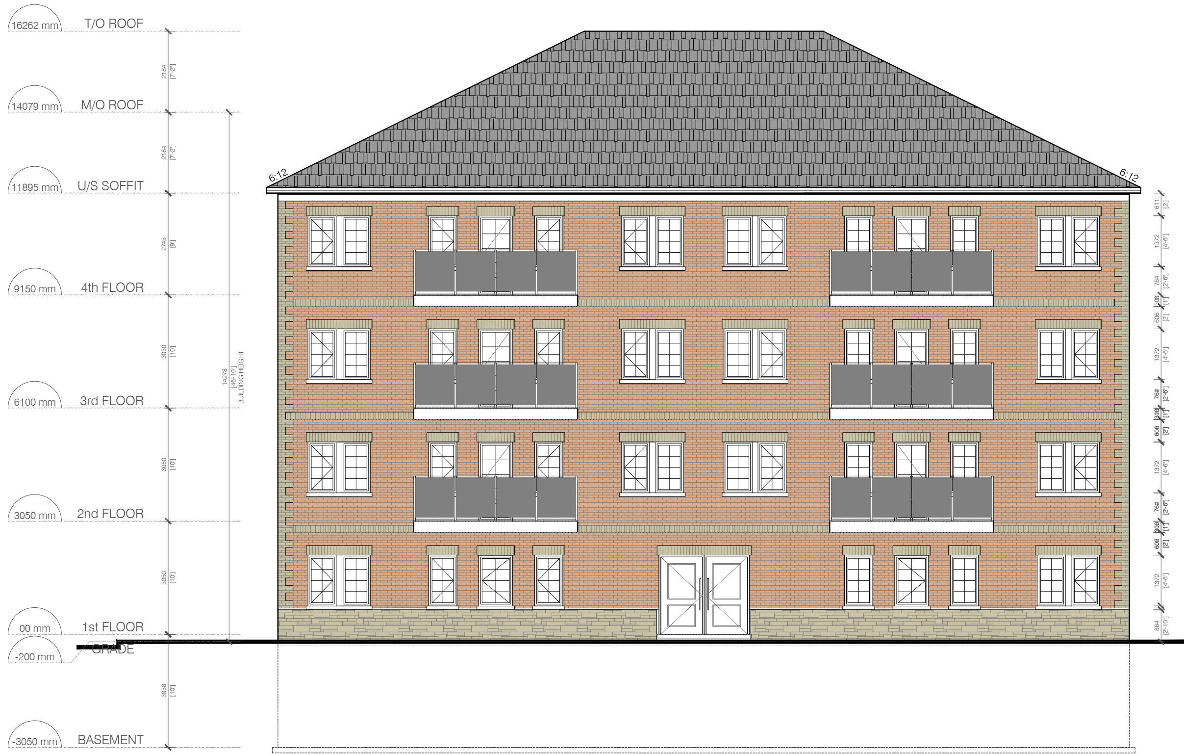
1 REAR ELEVATION (NORTH) A301 SCALE: 1:100_1