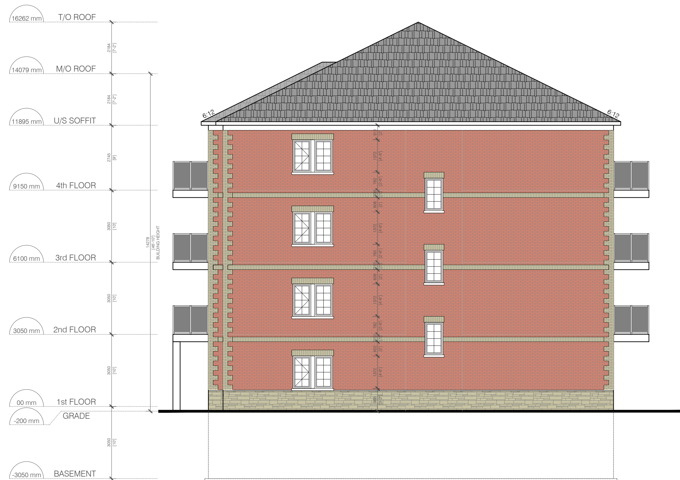
1 SIDE ELEVATION (EAST) A303 SCALE: 1:100_1