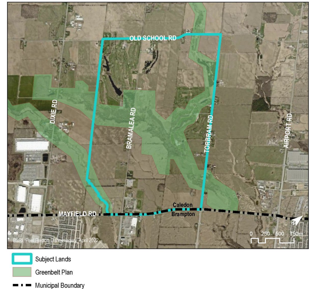
Figure 1.1 Subject Lands